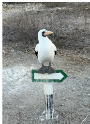
Nazca Boobie Showing the way On Genovese Island