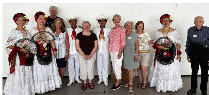
Welcome by the Xalapa Club, dancers from the University of Vera Cruz