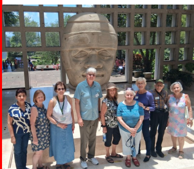
Outside the Museum of Anthropology in Xalapa, Heads made by the Olmec people, earliest known civilization in area 1200-400 BCE (Before Common Era)