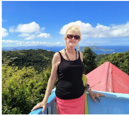
Mountain top view Tortola, BVI